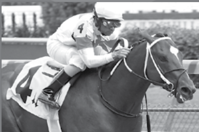
Midlantic Fall Grad CINCO CHARLIE Winner of the 2014 Bashford Manor S-G3