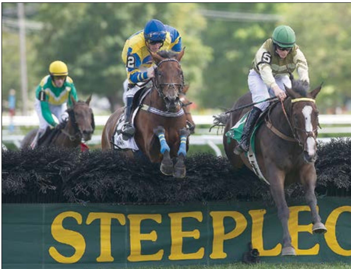
Brilliant Match (right) jumps the last with a slight lead on Cat Feathers.