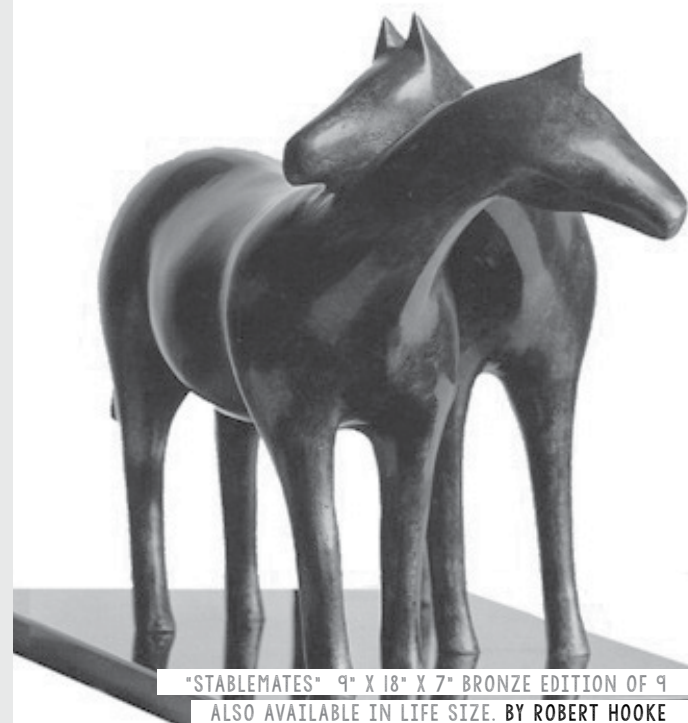
“STABLEMATES” 9” X 18” X 7” BRONZE EDITION OF 9 ALSO AVAILABLE IN LIFE SIZE. BY ROBERT HOOKE