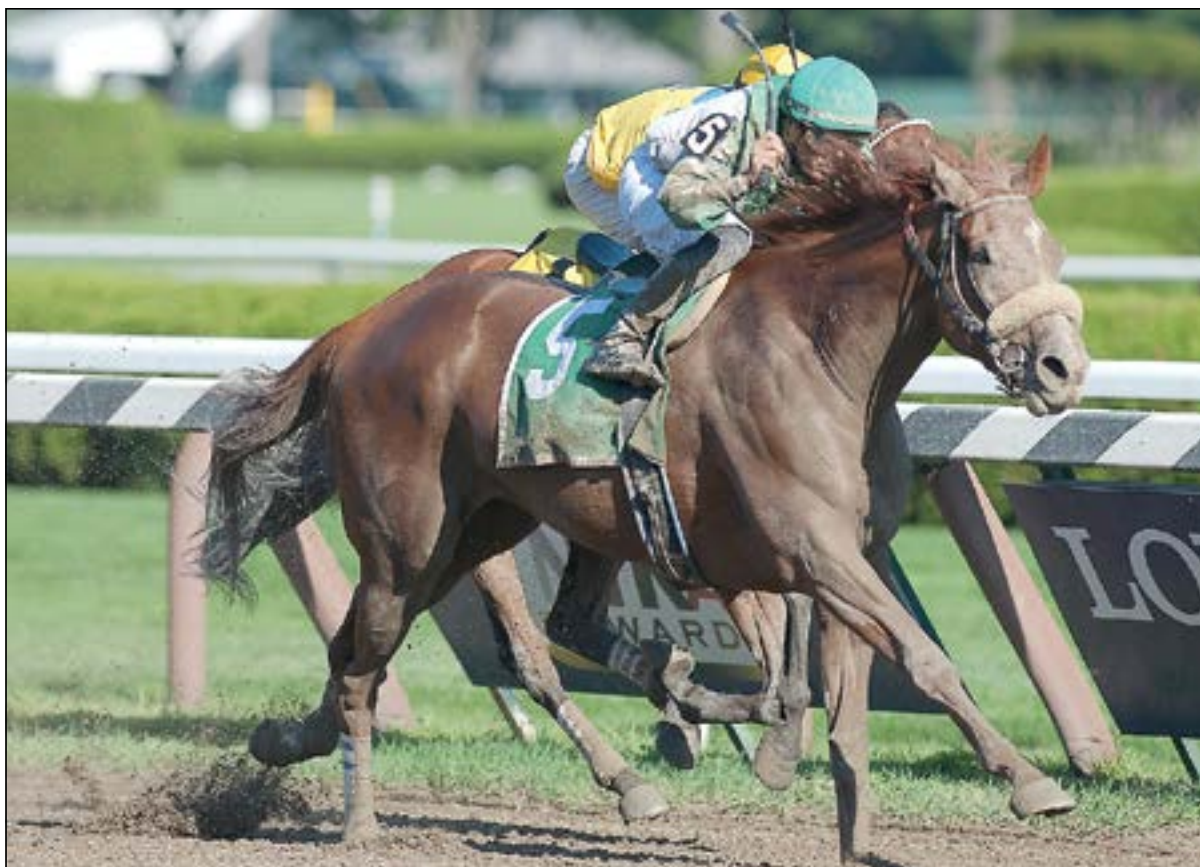
Star Grazing surges past Flipcup late in Sunday's Fleet Indian Stakes.