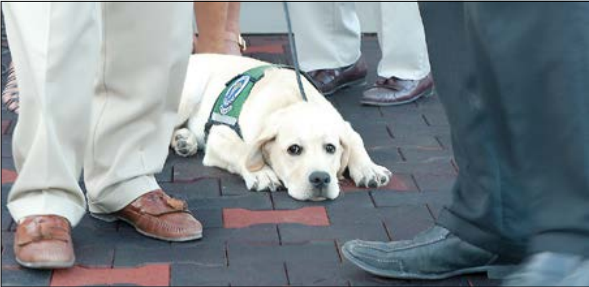
Dog Tired. Bennett, a future service dog (named after University of Virginia basketball coach Tony Bennett), gets an A for his behavior in the winner’s circle after the Albany.