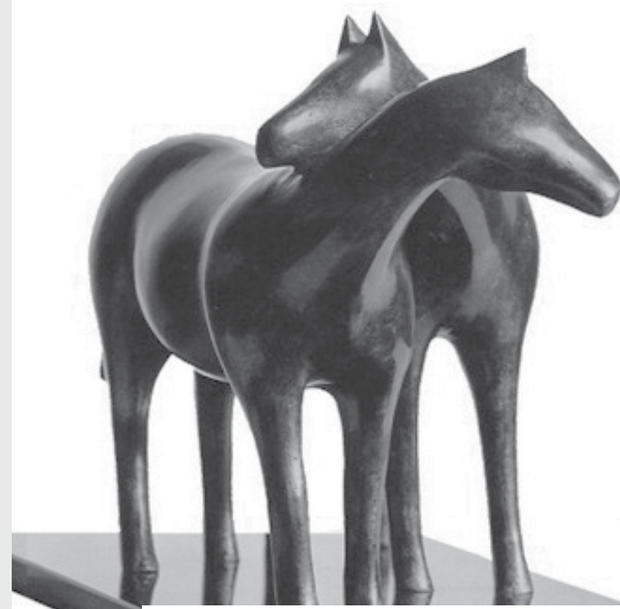
"STABLEMATES" 9" X 18" X 7" BRONZE EDITION OF 9 ALSO AVAILABLE IN LIFE SIZE. BY ROBERT HOOKE

GIDEON PUTNAM HOTEL 24 GIDEON PUTNAM ROAD SARATOGA SPRINGS, NY PHONE: 302 547 3517