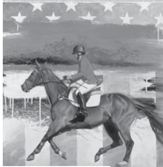
"BRING IT HOME" 36" X 36" OIL ON CANVAS. BY SHAWN FAUST